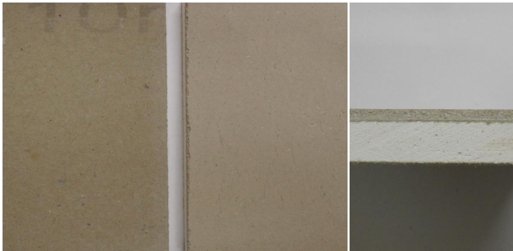
Figure 1 Representative specimen (From left, back face, exposed face, and side profile)

The product submitted by the client for a full test was identified by the client as Rockcote Earthen Natural Clay Décor Finishing System plaster applied over plasterboard. The Earthen Clay Décor was reported to comprise of natural earthen materials, washed and graded sands, various clays and proprietary additives. A similar product identified as Rockcote Earthen Natural Clay Décor Finishing System plaster over concrete was subjected to a single indicative test and was identified by the client to be of the same manufacture but with a fissured/perforated exposed face. Figure 1 illustrates a representative specimen of those tested.