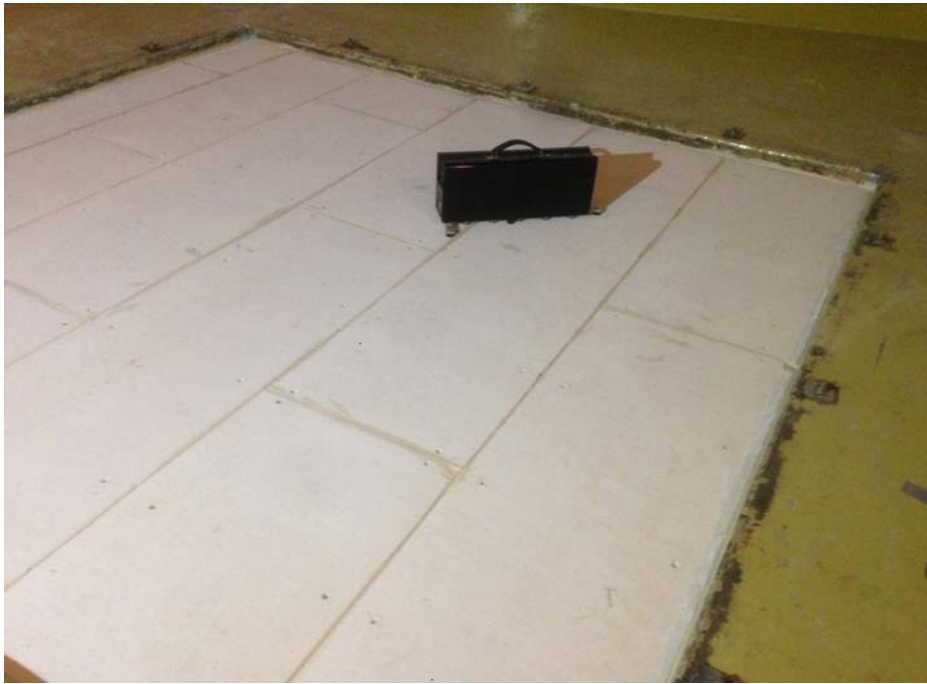
Figure 3: One of the tapping machine positions on the floor