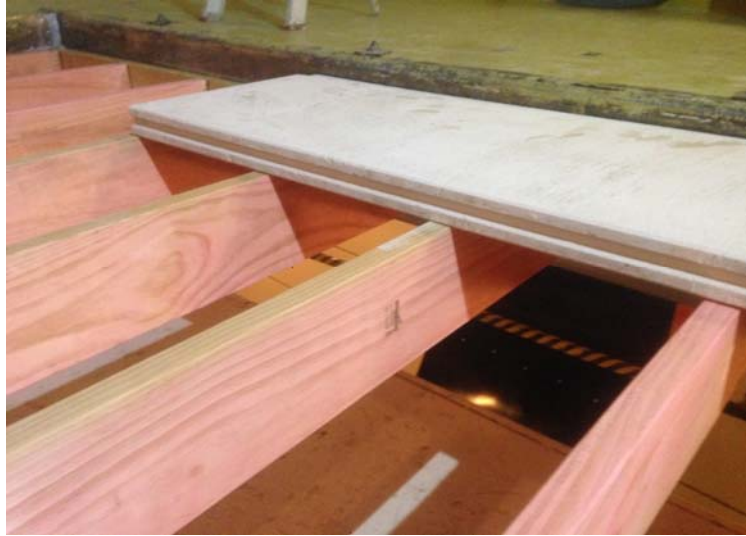
Figure 1: Floorboard sitting on frame