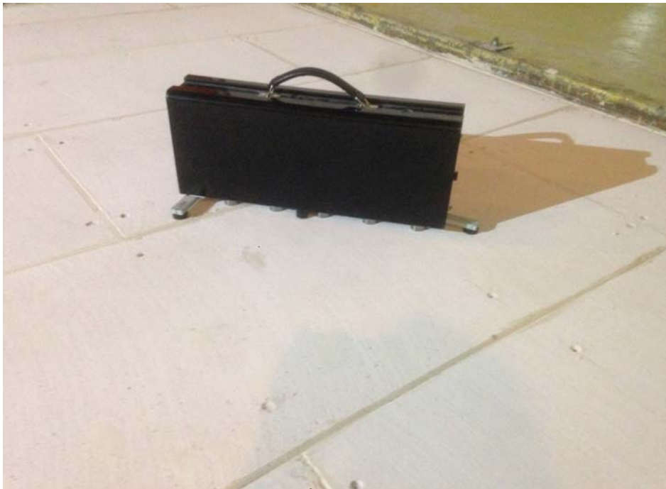
Figure 4: Tapping machine placed on floorboards