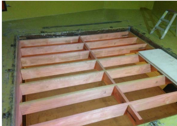
Figure 2: Floor frame installed in floor cavity