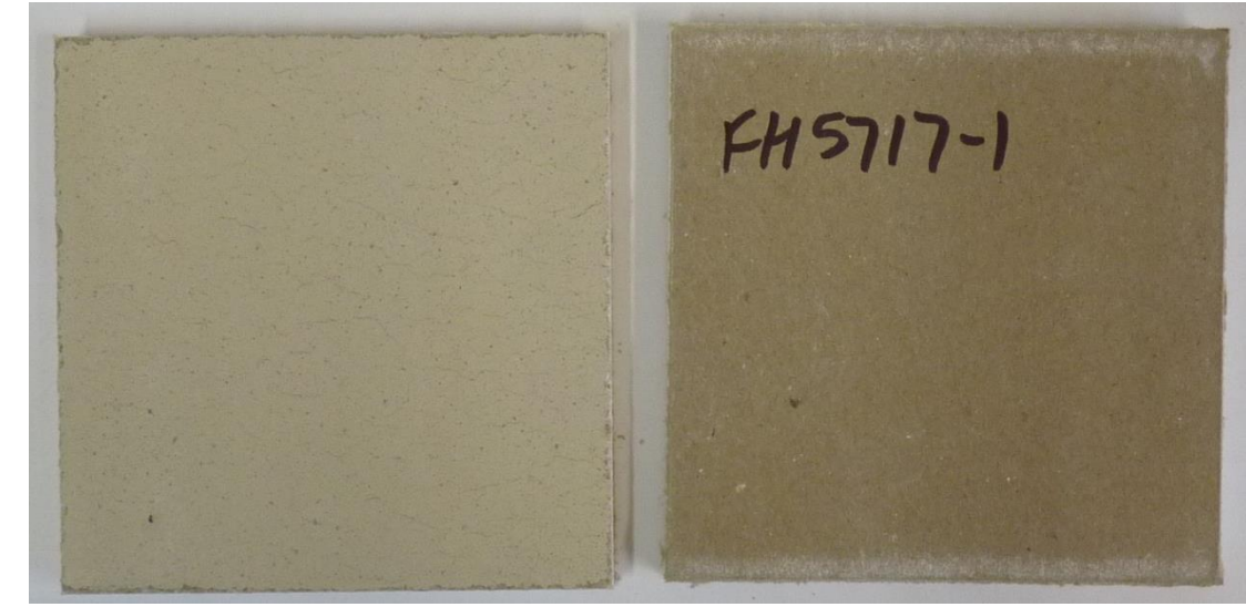
Figure 1: Representative specimen (front face on left, back face on right)

The product submitted for testing was identified by the client as Rockcote Marrakesh over Resene Quickdry on a standard grade plaster board substrate. Figure 1 illustrates a representative specimen of that tested.